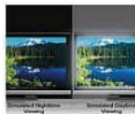
Auto Brightness Control for Plasma, LCD TV